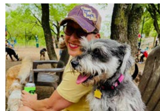
Hanging out at the dog park.