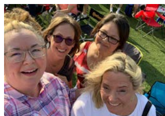
Spending time with neighborhood friends.