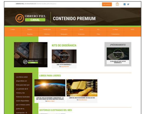
Obrero Fiel Premium Subscription

With this task almost behind us, the website is better positioned to attract new users, encourage new sponsors and grant-donors (as well as personal supporters) to invest in the ministry, and sets us up to offer new premium content for serious church leaders. Because the Camino Global (CAM International) name carries over 100 years of trust and sound theological teaching, Obrero Fiel is used by many who know that the content we suggest/provide is theologically sound. If you would like to, or know someone who would like to contribute to this ministry, please let me know. Or give online at avantministries.org/give .